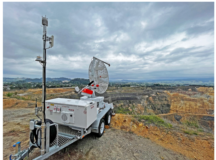
The Radar used to constantly monitor the Martha Open Pit.

The full update can be found here: www.waihigold.co.nz/newsletters/the-waihi-gold-update/